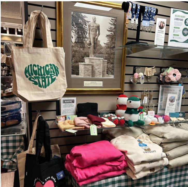
Market at Kellogg