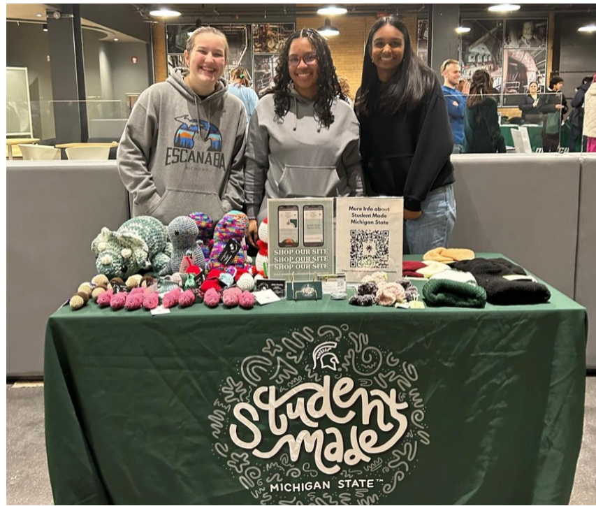
Pop-Ups and Online Marketplace